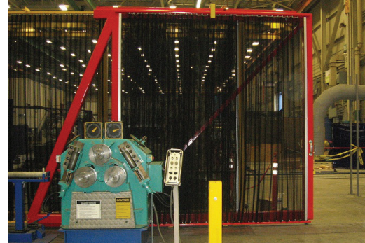
400-Ton Press Gate

During aircraft fuselage testing, GuardianCoil is used to wrap the cabin as a precaution to intercept and subsequently stop any debris effectiveness of our GuardianCoil by projecting several 1.2in diameter x 2.5in long [30.5mm x 63.5mm] steel slugs into draping 3/32"-21gauge steel mesh at 170 feet/sec [51.8 meters/sec]. The woven wire mesh stopped all the slugs. GuardianCoil was adopted by the world's leading aircraft manufacturer as their destructive testing.